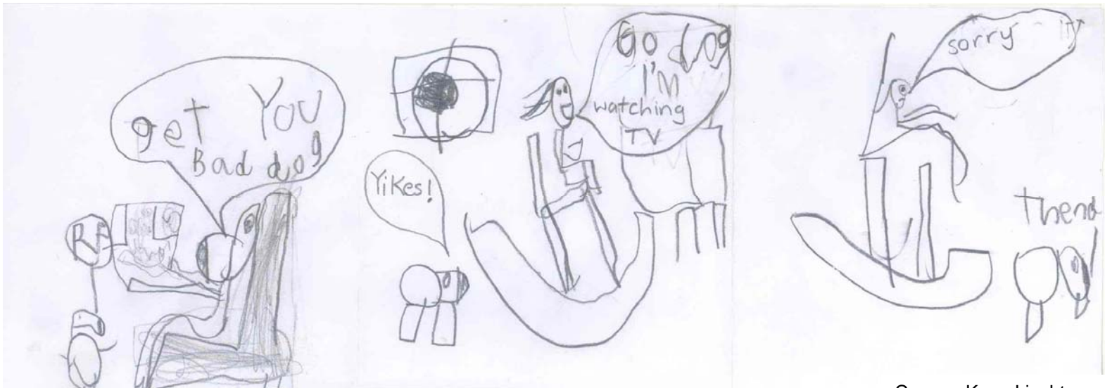
Cormac Koop Liechty