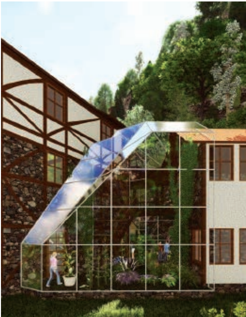
Science building at Tehri View Architectural Render by Aishwarya Tipnis Architects

The plan includes a main building and annex with 12,100 sqft and 1,078 sqft of floor space respectively, approved by the Board and the Mussoorie Municipal Board.