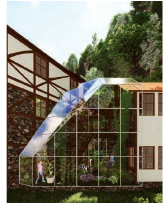
Science building at Tehri View Architectural Render by Aishwarya Tipnis Architects

The plan includes a main building and annex with 12,100 sqft and 1,078 sqft of floor space respectively, approved by the Board and the Mussoorie Municipal Board.